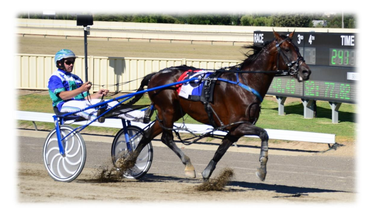
Multiple Group 1 winner and Colonial Stallion Bonus Sire - For A Reason

The Colonial Stallion Bonus Scheme is proving to be popular with Australian Breeders. This is demonstrated by 62% of all services to NSW domiciled stallions in the 2016/17 breeding season being by former Australasian Group 1 performers that stood in the state.