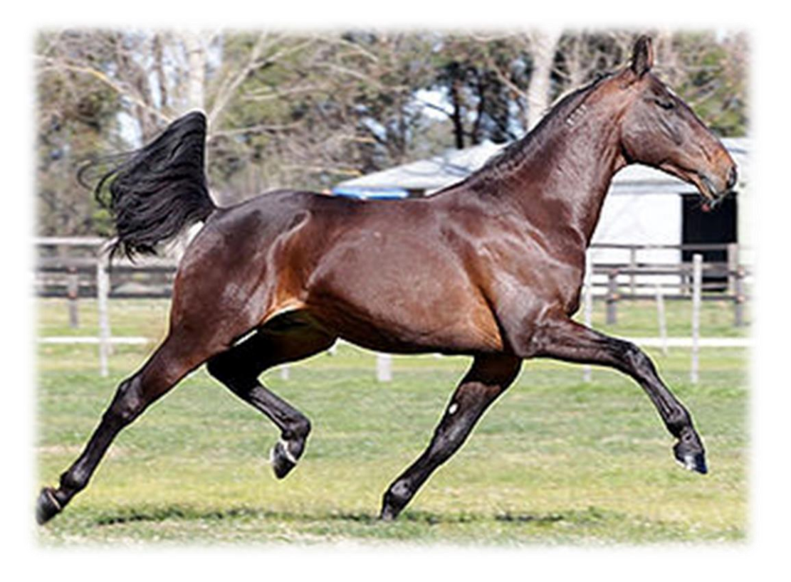
Multiple Group 1 winner and Colonial Stallion Bonus Sire – Caribbean Blaster